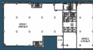
TOWER 2 (20 Storeys) 12,788 sq. ft.