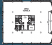
TOWER 1 (12 Storeys) 13,078 sq. ft.