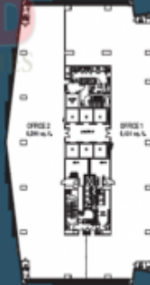
TOWER 5 (21 Storeys) 12,522 sq. ft.